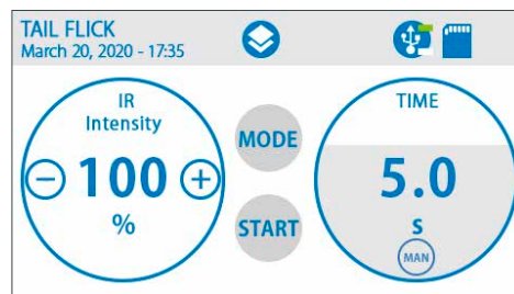
USB key to export csv data to PC